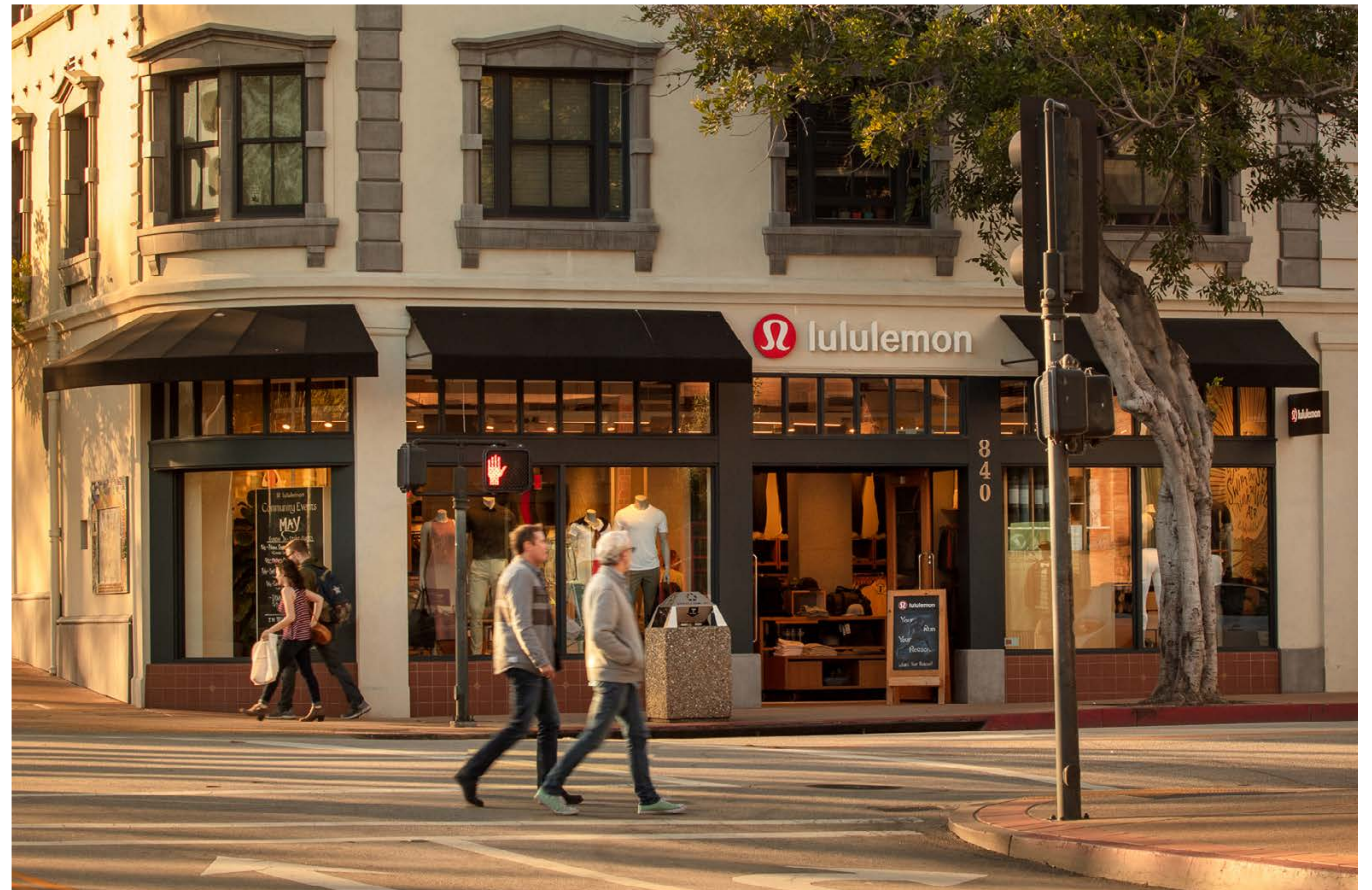
With a large number of working professionals, premium residential, important tourist attractions, and 5-star hotels located just steps away, 840 Monterey Street represents an outstanding opportunity for a unique specialty retailer.