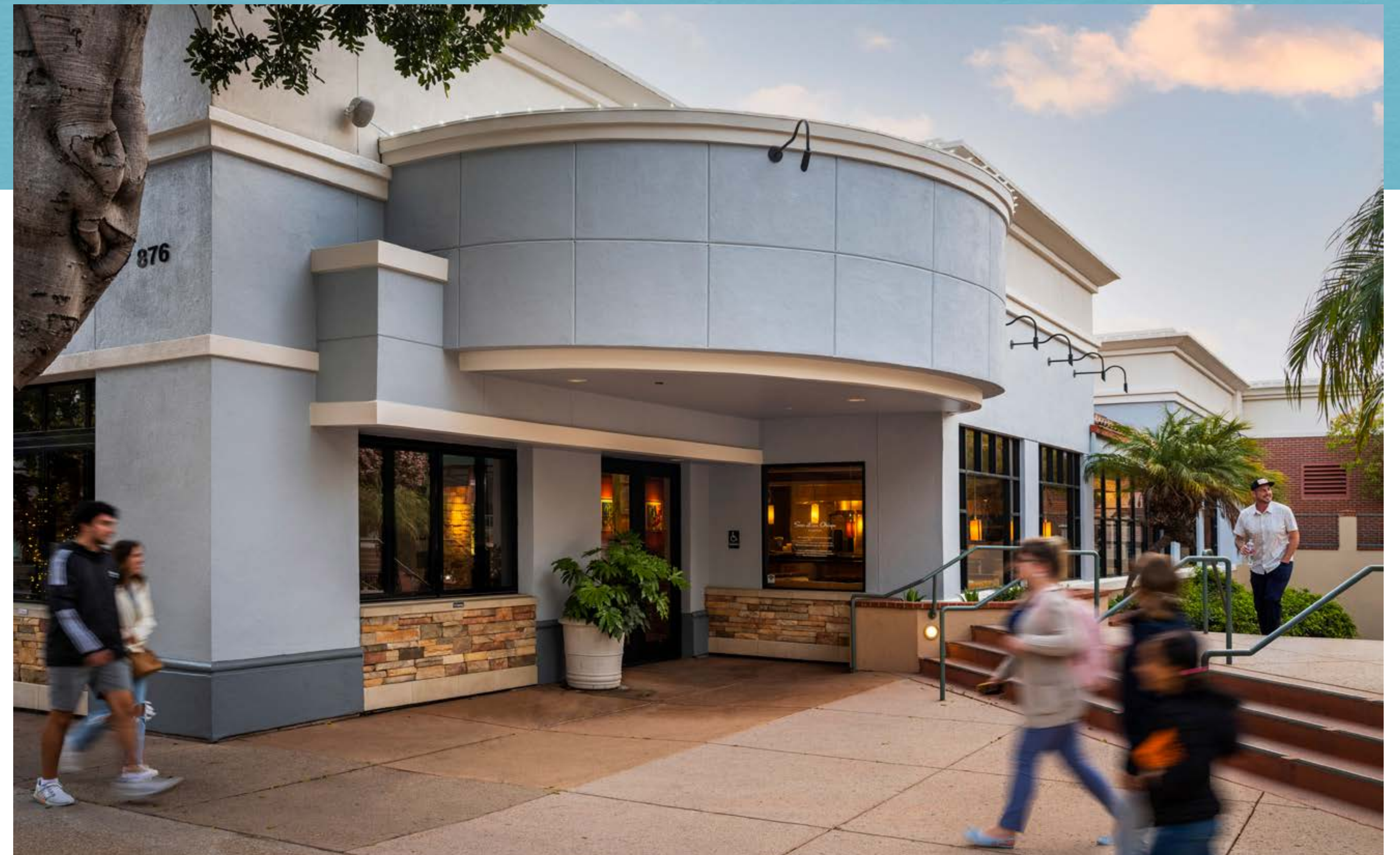
876 Marsh Street represents a unique opportunity for a restaurant / brewery / take-out or shared kitchen tenancy. New remodel plan includes ample streetside and open-air, skylight-covered seating.