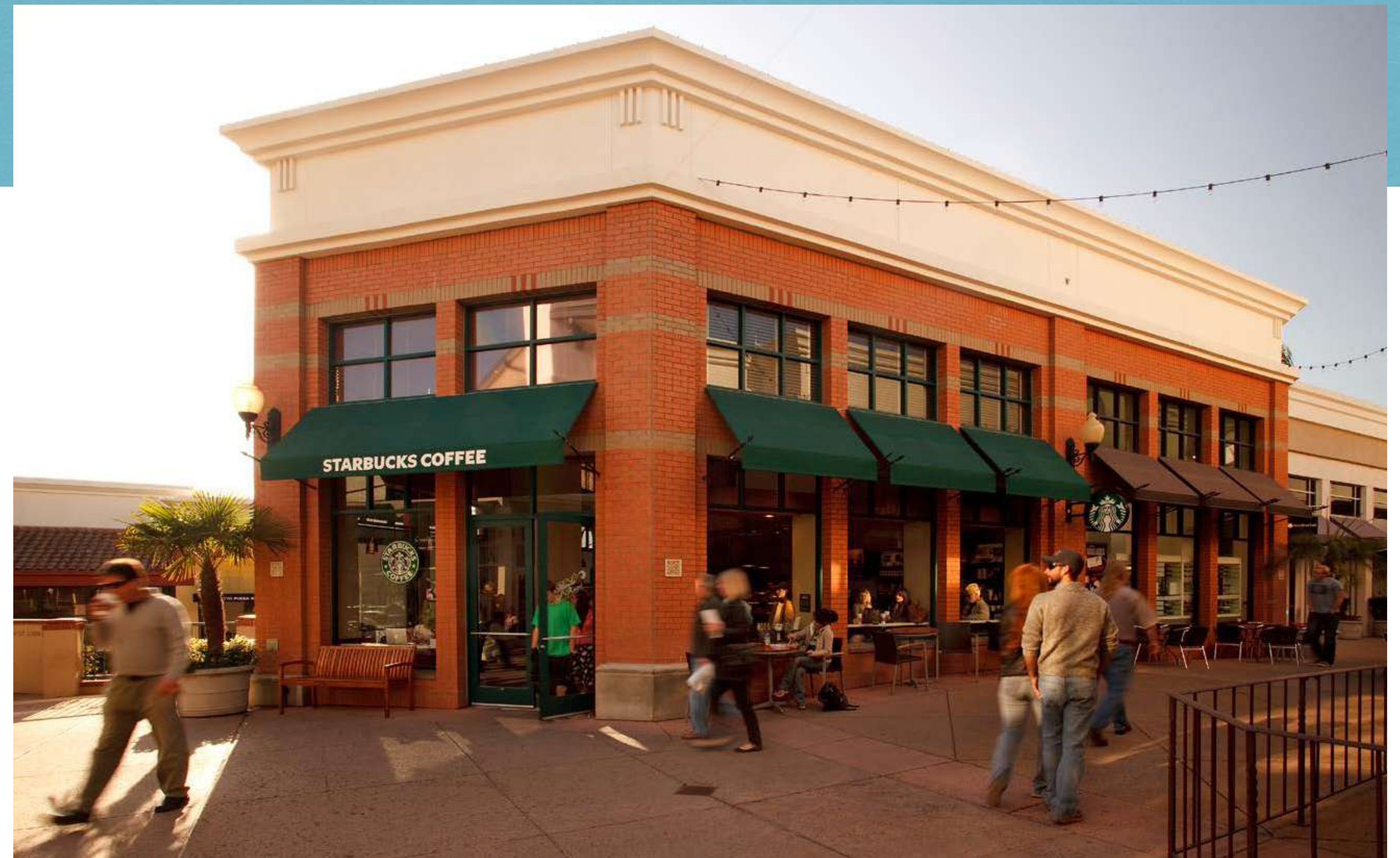
885 Higuera Street represents a unique opportunity for an outstanding fast-casual restaurant concept. High visibility and positioning at the entrance to San Luis Obispo's premier retail district create high foot traffic day and night.